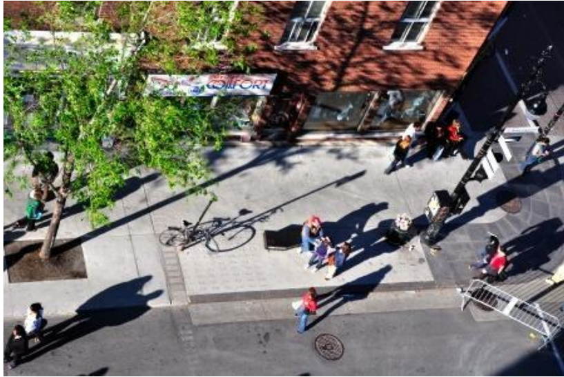
in the shadows of the urban (III)