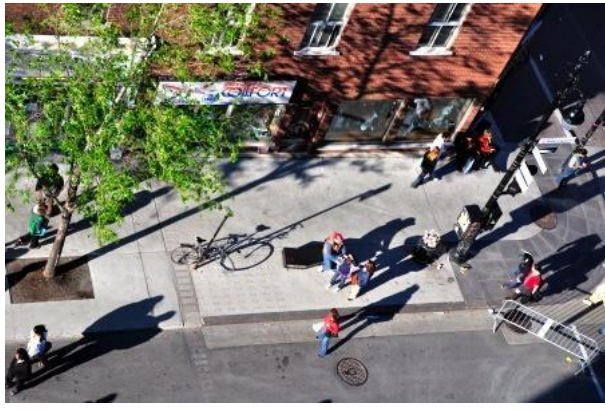
in the shadows of the urban (III)